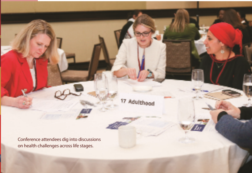
Conference attendees dig into discussions on health challenges across life stages.

transformative; (2) use an integrated approach; (3) extend to the hardest to reach and most vulnerable; (4) work towards institutional and systemic change; (5) measure impact and data; (6) prioritize feminist partnership; and, (7) include advocacy and political will.